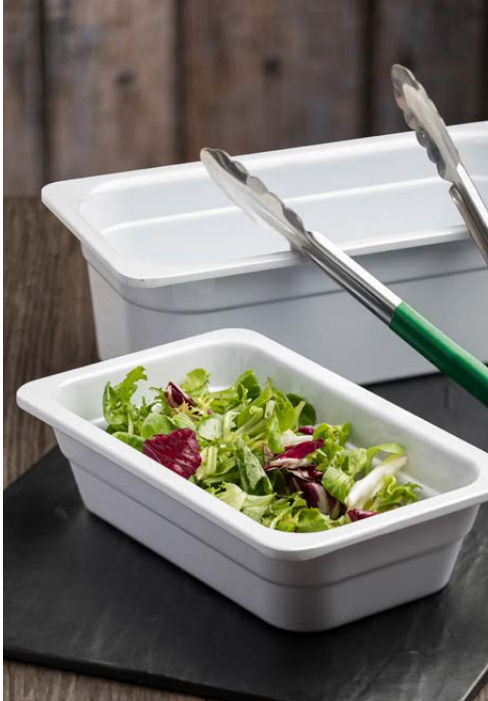
Gastronorm sizing guide:

Melamine is dishwasher safe (as long as the water temperature does not exceed the 100°C guidelines). Scouring powder should not be used, as it will scratch the surface, also never use chlorine bleach on melamine buffetware.